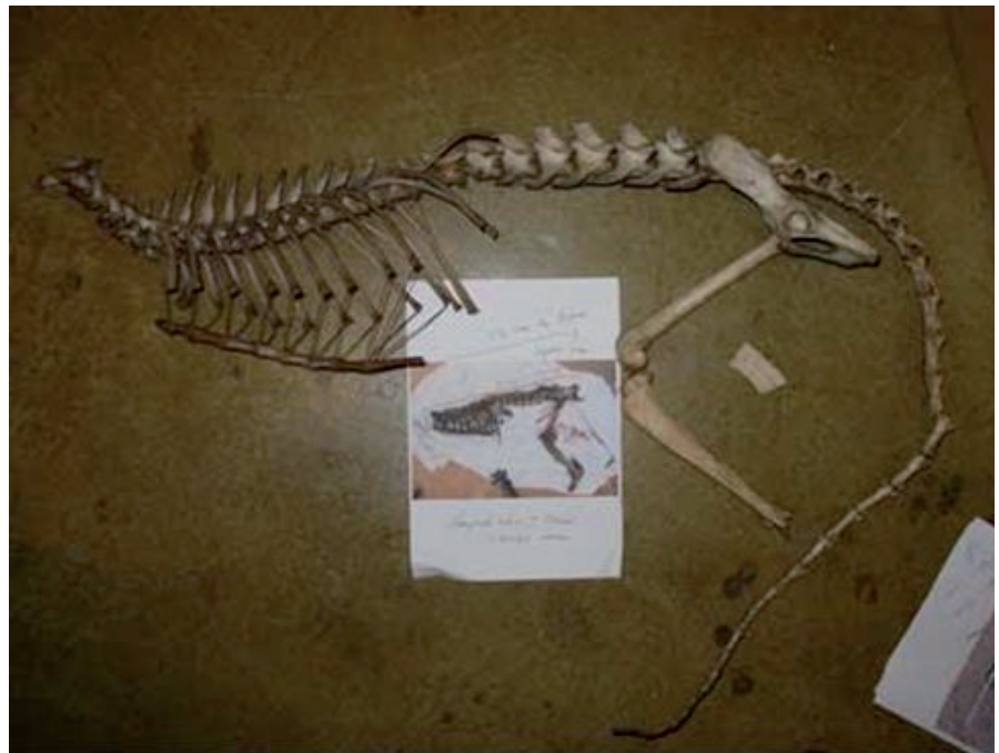
Fig. 3. Ribcage of a leopard at Naturalis next to a picture of the Cameroon leopard ribcage

We conclude that lions, leopards and spotted hyenas occur throughout the entire BE, in a variety of habitats. Our data further suggest that lions occur in lower densities in hunting zones than in national parks, which could have important implications for management practices in the hunting concessions (B. M. Croes, pers. comm.). Analysis of these data is ongoing and will be published together with the results of the combined track- and camera-trapping surveys. However, the absence of photographs and tracks of both cheetahs and wild dogs, along with the answers from the questionnaire surveys, leads us to conclude that both cheetah and wild dog are no longer present in the BE. As there are no other areas in North Cameroon where either species could occur or have been reported, we conclude that both are functionally extinct there. From a regional perspective there is no evidence of any viable population of either species surviving in Nigeria. There is some information on the existence of cheetahs in the Central African Republic (CAR) and Chad (P. Chardonnet, pers. comm.), and also in Algeria, Niger, Benin and Senegal (Croes et al. 2008). It seems unlikely that cheetahs and wild dogs will be able to migrate from these countries into suitable habitat in Cameroon. The last hope for possible remigration rests