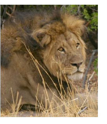
Nose Pigmentation: 7 yrs: ~50-85% black 8 yrs: 75-100% black 10 yrs : 100% black