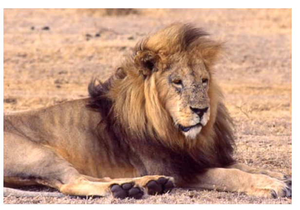
Muzzles and flanks can be heavily scarred.

Fully mature and massive, muscle tone declines with age so they may appear smaller than younger males. Hair on the muzzle begins to thin by about 7 years and becomes progressively "pock-marked". Mane fully developed with ends mostly smooth but begins to look fuzzy around 7 years. Greater than 8 years, the mane loses condition, may thin, hair ends split, and length shortens as lion loses condition.