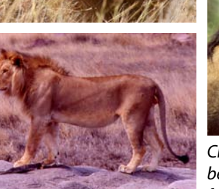
Chest and shoulder can be darker than neck and forehead.

Teeth: Typically white with minimal yellowing. Little wear except for slight chipping on the longitudinal ridge on the back of the canines—if any teeth are not fully erupted he is younger than 3 years.