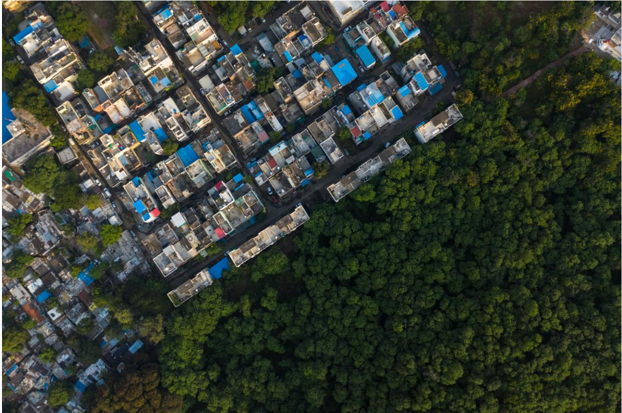
Figure 3: Another drone shot of urban Bhopal.