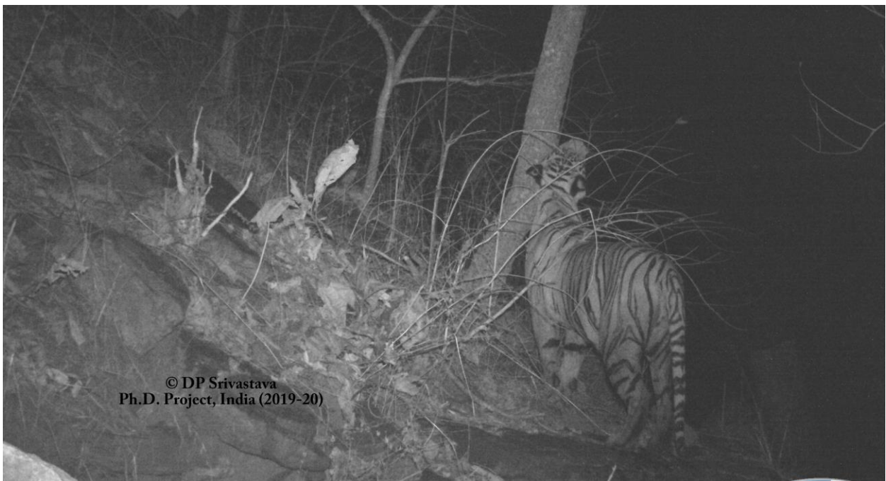
Figure 4: A tiger sniffing a scent lure placed on a tree in a stream flowing through the urban area (refer photo 2 too)