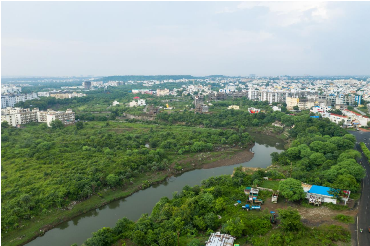
Figure 2: The urban landscape of Bhopal

Between March and June 2021, I will assess people perceptions of living with wildlife large carnivores and factors supporting people's perception. And the willingness to co-exist with tigers in the landscape. These surveys will be done in each of the grids and along the city gradient, i.e. built-up city, semi-urban and rural areas (all exist within the city). Additionally, I will also interview local conservation groups and govt managers to understand their experiences and the challenges of conserving tigers in urban landscapes. All the information will be summarized to make meaning of human will to live with and manage large carnivores in Bhopal.